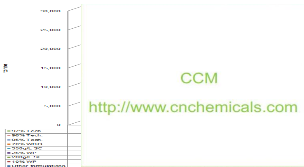
Figure 1.3.1-1 China's export volume of imidacloprid technical and formulations, 2011-2015

Note: Other fomulations include 200g/L SC, 240g/L SC, 250g/L SL, 480g/L SC, 50% WP, 5% EC, 600g/L FS, 600g/L SC, 70% WP and 70% WS.