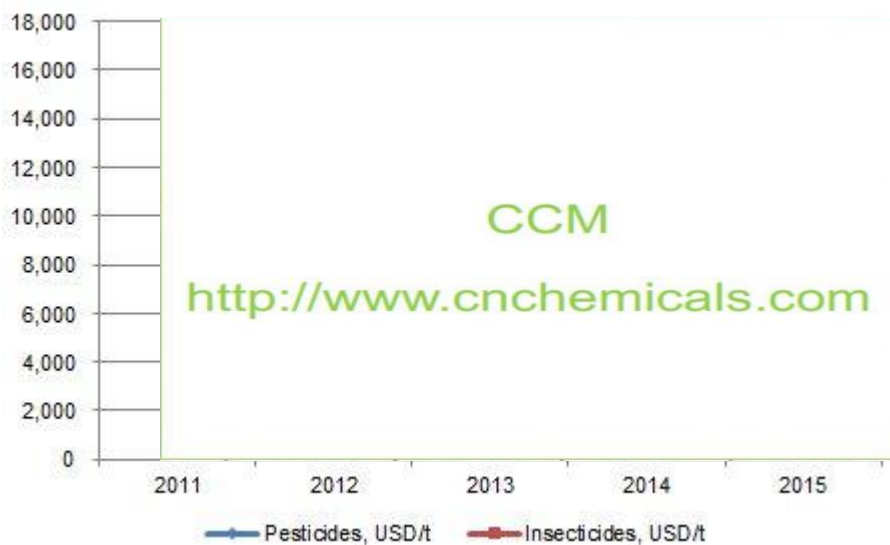
Figure 1.4-3 China's average import price of pesticide and insecticide formulations, 2011-2015

Note: CAGR'11-'15 of pesticide formulations: 3.67%;